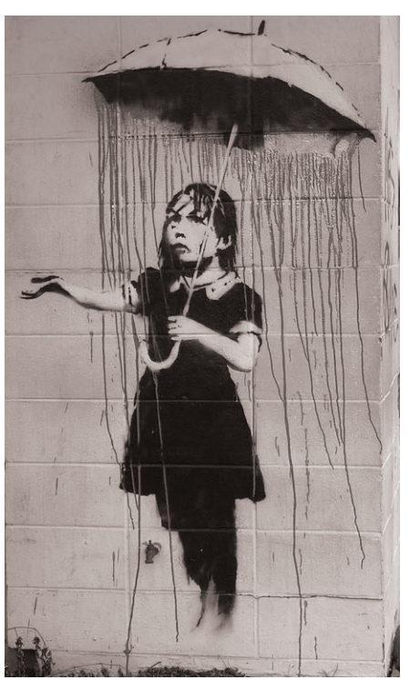
IF SIN IS DESTROYING US, WHY DON'T WE JUST STOP?